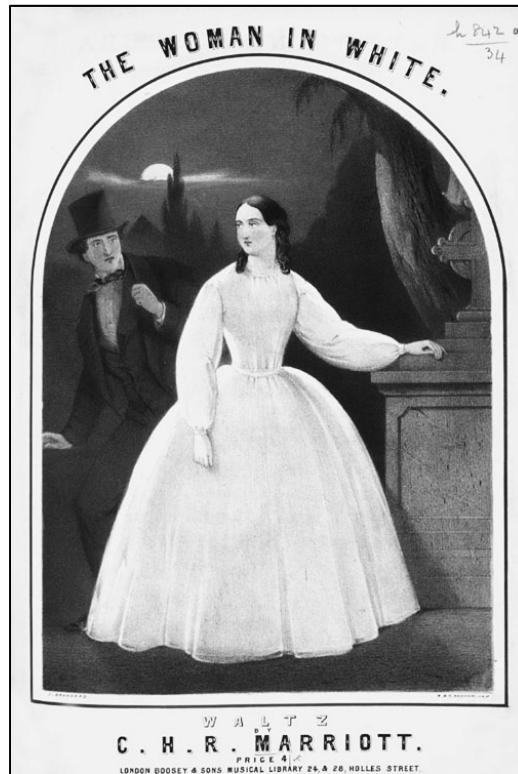
Figure 2: Cover, sheet music: “The Woman in White Waltz,” by C. H. R. Marriott Lithograph cover of sheet music. London: Boosey & Sons Musical Library, [1861].

Additionally, the market was flooded with knock-off versions of popular serial novels in an attempt to capitalize on the fad. In March 1839 alone, readers looking for something to fill in the time between numbers of Nicholas Nickleby could choose from works such as Valentine Vox the Ventriliquist , Will’s Whim, Consisting of Characteristic Curiosities , Charly Chalk , David Dreamy , and Paul Periwinkle or the Pressgang (Sutherland 92)—the authors of all of which appear to have determined that the use of “spluttering consonantal alliteration” (92) in titles was the secret of Dickens’s success. Not unpredictably, the majority of these imitations never reached their sales projections and most collapsed after fewer than five installments. Sutherland observes that “altogether in 1839-40, the addict could have spent 15 shillings to a pound a month on